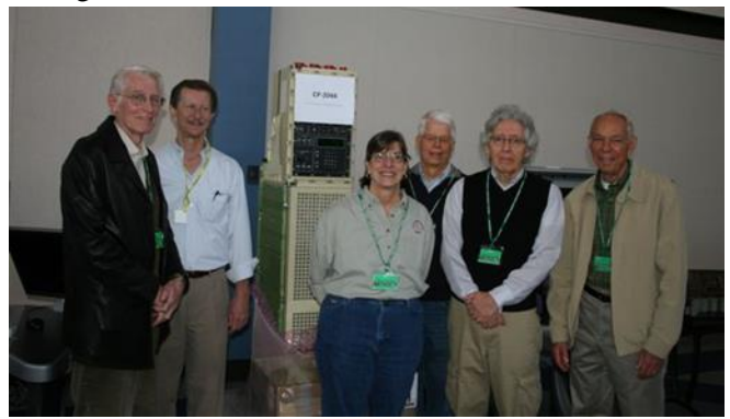
The individuals in this photo, taken November 20, 2012, prior to shipment to the Lawshe Museum, all worked on the Japanese P-3C project (L \rightarrow R) :

The CP-2044 shown below was used in Eagan for system development and checkout in support of the Program Generation Center/Software Development Facility (PGC/SDF) Eagan installed and supported onsite in Atsugi, Japan. The shutdown of Plant 8 resulted in shipment and storage of this unit in Clearwater. Lockheed Martin donated this computer to the Dakota County Historical Society, resulting in its shipment back to Eagan.