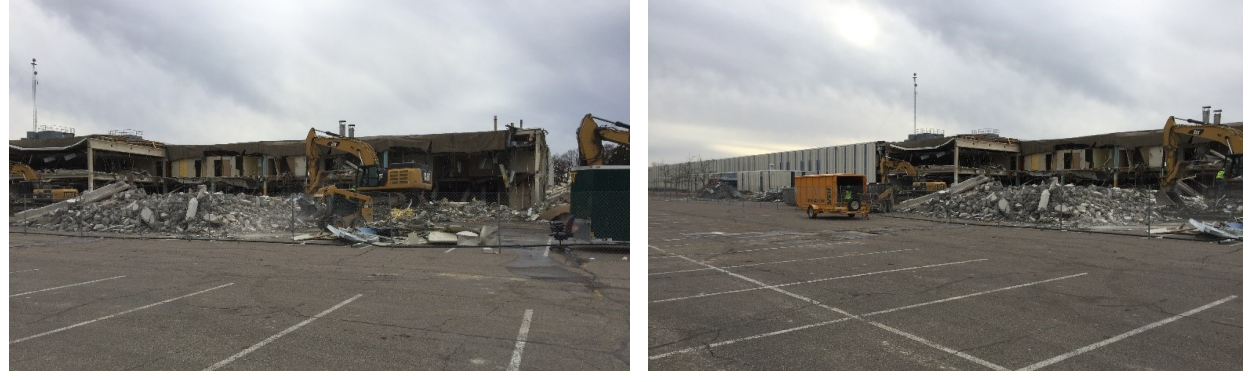
UNIHOG/UNITUKEY participants on November 17th.

Unisys, Roseville former facilities are in the dust to dust process.