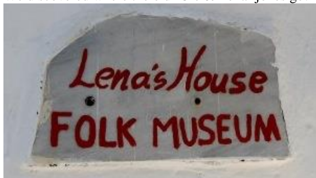
Ole & Lena savor their jokes too!

We discovered where the old 'Ole & Lena' jokes go!