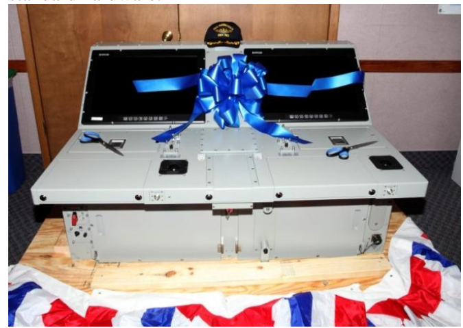
This unit will be installed aboard the USS Minnesota (SSN-783) - a new Virginia Class attack submarine.

The end of the '65 Years' poster is: March 2, 2011 Delivered S/N 8000 AN/USQ-70 Dual Display and Processor - Today's Naval Tactical Data System standard hardware.