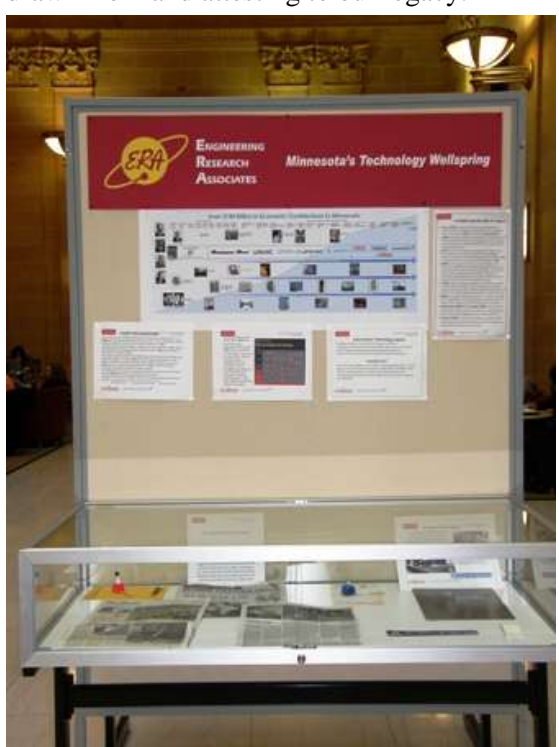
Photo 3 shows the first two decades of our computer genealogy as hardware advancements in one generation pushed ingenuity and inventiveness onto the next generation. This process has been uninterruptible and continues today.

Photo 2 shows the primary side of the display which contains two large posters generated by VIP Club sponsor Lockheed Martin. The family history (ancestor chart) of Unisys is also displayed here with roots going back through Sperry and Burroughs to Remington and other originators. Another interesting "time-lined" chart shows our corporate interactions with the University from 1958 to the present. In the display case are significant hardware artifacts (or photos thereof) as well as newspaper articles, photos, booklets and books drawn from and attesting to our legacy.