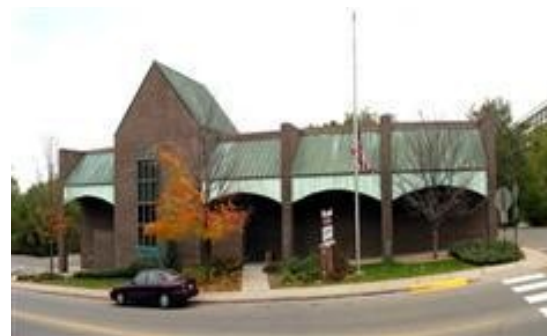
DCHS Lawshe Memorial Museum South St. Paul, Minnesota