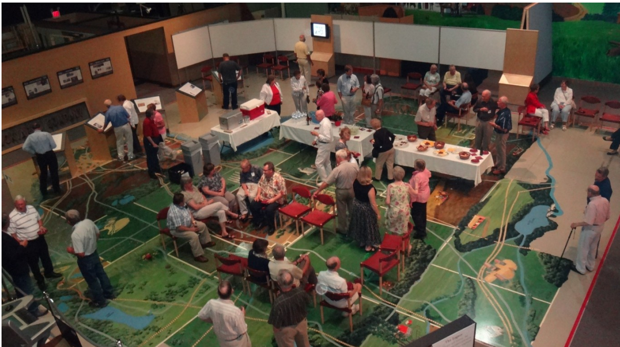
Legacy Display Opening Celebration DCHS Lawshe Memorial Museum Great Hall

This spring of 2015, VIP Club volunteers will help the museum staff finish the second grant contract and: