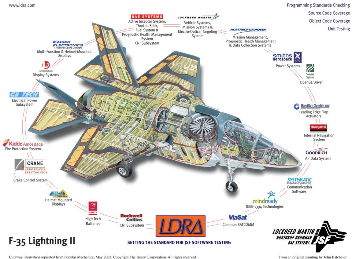
Figure 2. Numerous companies formed the F-35 development and production teams.