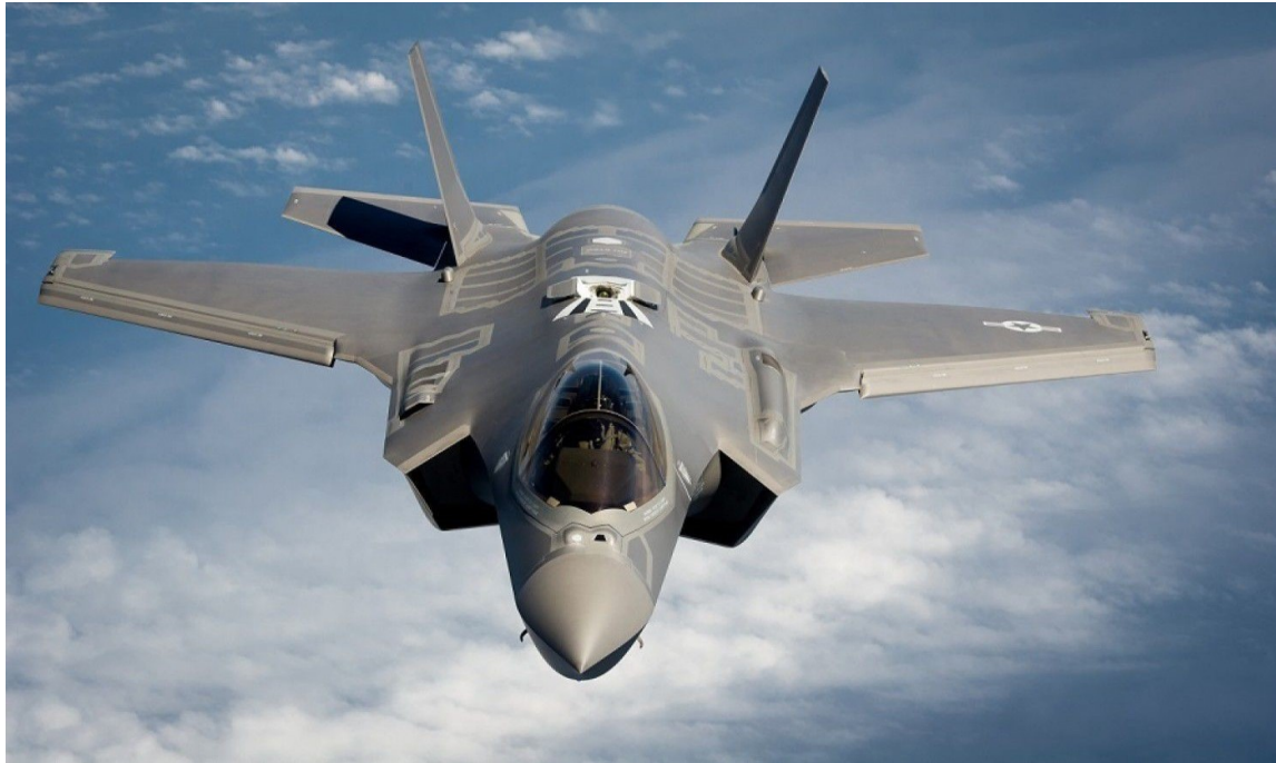
Figure 3. Refueling socket is obvious just behind the cockpit.