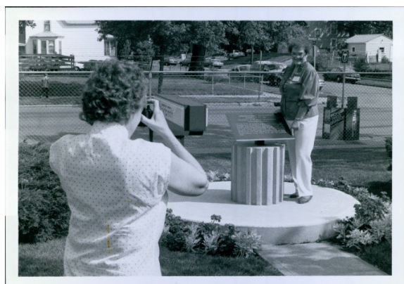
Picture 5. Insufficient resolution to read nametag of lady by plaque monument, does anyone recognize her face?