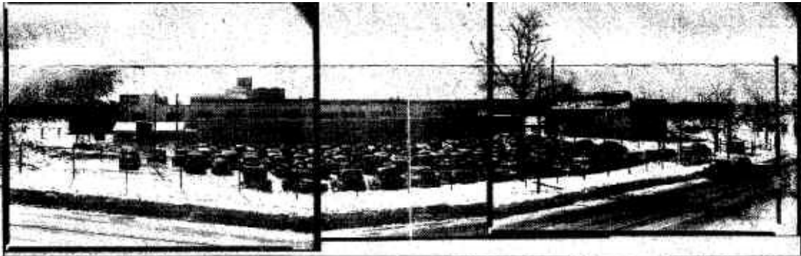
The pioneering Engineering Research Associates computer firm occupied the plant on Minnehaha from 1946 to 1955.