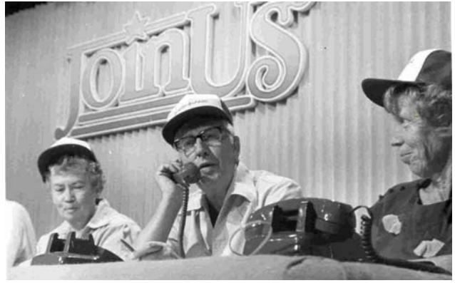
United Way PBS