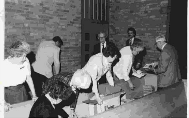
Ushering for St. Paul Chamber Orchestra, May 1983, United Church of Christ