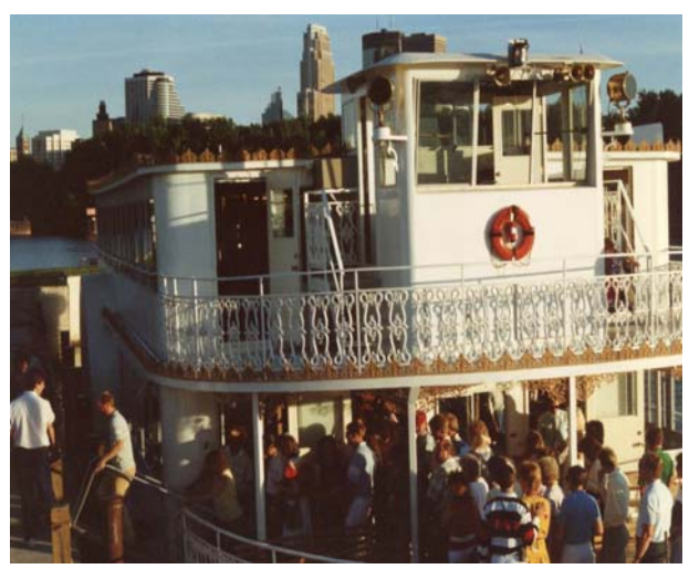
Mississippi River Boat Cruise

Excursions and Outings – Club members, over the years, have been active, enthusiastic partakers of local excursions as well as more distant travels and outings. These have included trips to the Janisch Brothers farm in Wisconsin to enjoy the collection and processing of maple syrup; overnight casino/theater bus trips; St. Croix River boat and bus trips; river boat cruises on the Mississippi; horse racing at Canterbury Park and many other enjoyable events.