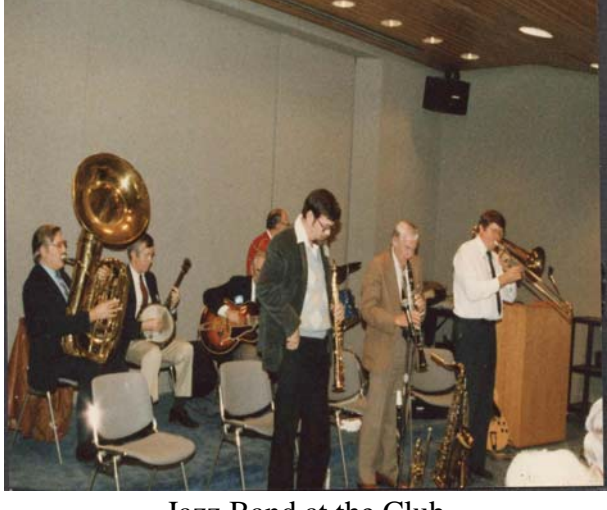
Jazz Band at the Club