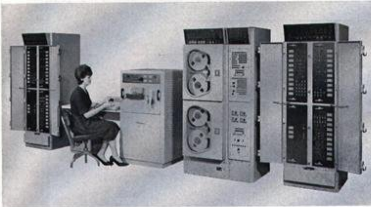
figure 3—UNIVAC 1218 Computer

made to "coast" at the target's last computed rate and direction.