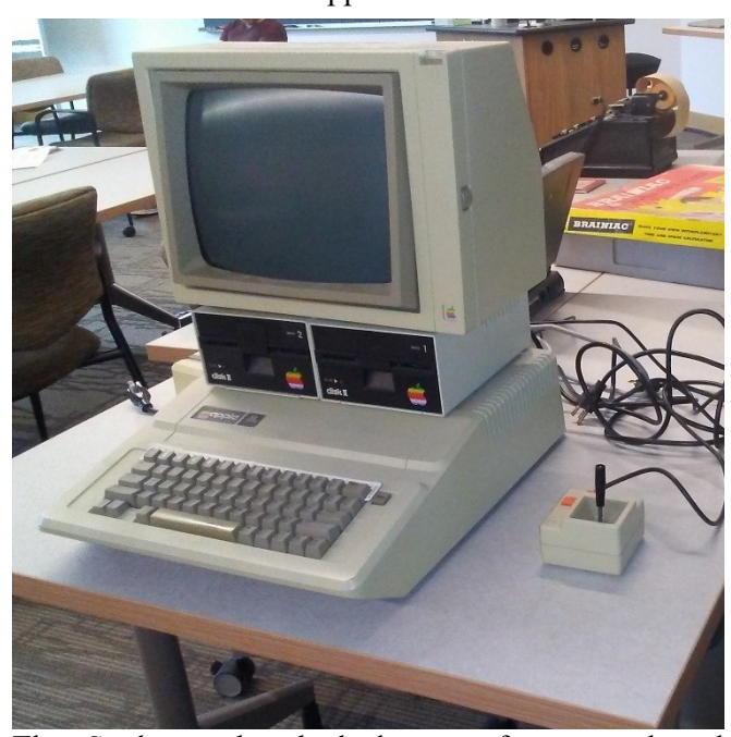
The Students also looked at a few pre-selected technology history boxes in the archives. Page 7 has some snapshots of the archive contents.

In three areas of the classroom, the students wrote reports about some technology folders; technology history books; and an artifact area with couple of hardware calculators, an electronic logic wiring game, and this nonfunctional Apple II Machine.