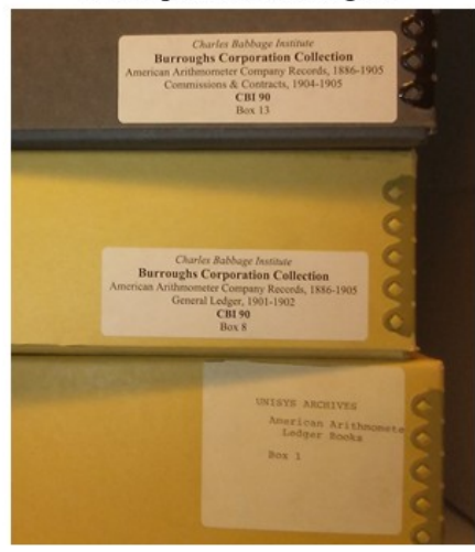
Burroughs and UNISYS ancestry tracks back to American Arithmometer Co., 1896.

The CBI racks and stacks of archive boxes are all in a sub terrain limestone cave beneath the U of MN west bank campus.