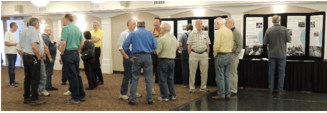
The second most popular activity was a cool one!