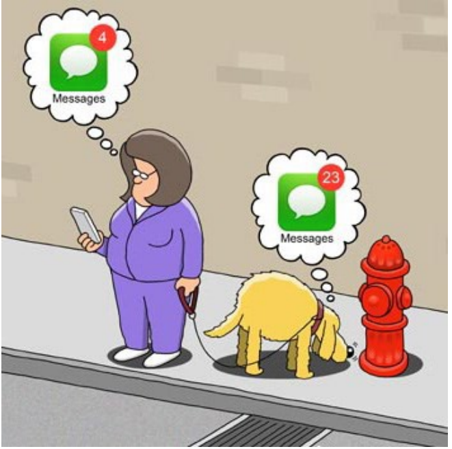
3. Original source unknown!