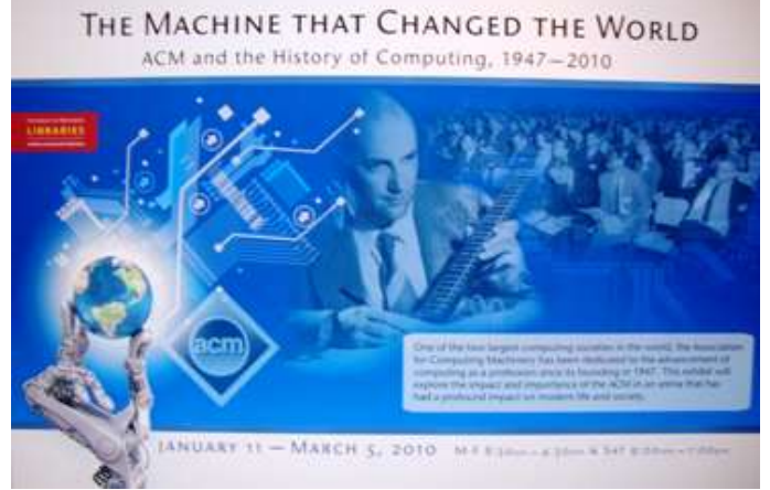
In the founding meeting of ACM, the association's purpose was stated in their constitution as

A recently concluded exhibit in the Andersen Library Gallery at the University of Minnesota chronicled the significant events of the ACM's history.