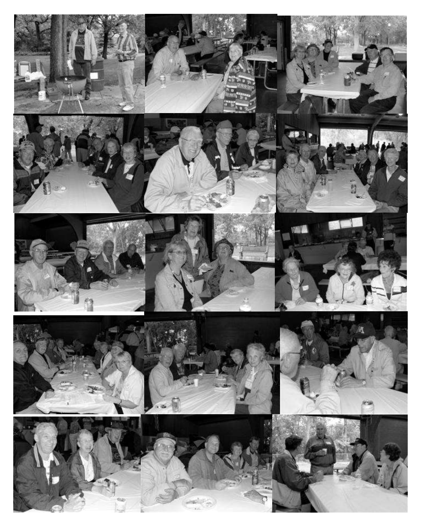
VIP Club annual picnic at Highland Park June 11, 2008