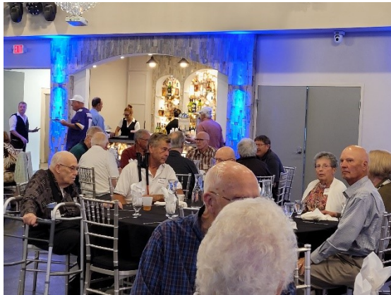
More socializing during the Social Hour