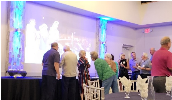
The dessert line proved popular . . .