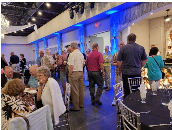
Socializing during the Social Hour