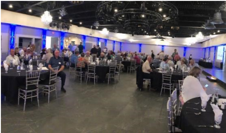
The party scenes at the Royal Cliff Event Center