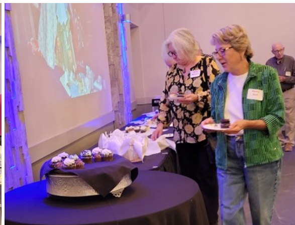
. . . and drew a crowd for conversation