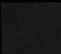
End Panels Slate Gray