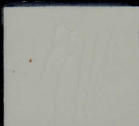
Front and Rear Pale Gray