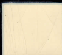
Work Tops Off White