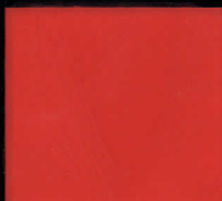
Accent Red Ocher