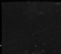
Frame Slate Gray

Five colors for end panels are offered on large-scale UNIVAC Systems. Choose one of the five.