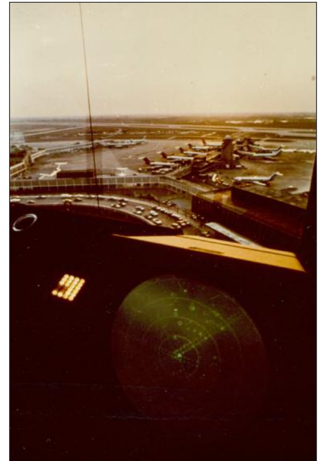
Above: Two views out of the Chicago O'Hare airport air traffic control tower with radar screen in view. The NTDS system provided the company with the baseline technology used for the ARTS I system.