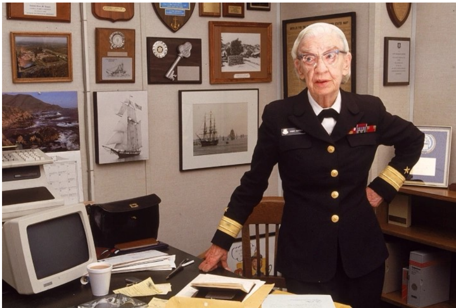
Dr. Grace Hopper in her office in 1984, near the end of her U.S. Navy career

From the Techland.time.com web site, attributed to Harry McCracken: